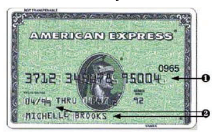
Figure 4-5. Example of Fraudulent Embossing

Characteristics of fraudulent Embossing include: