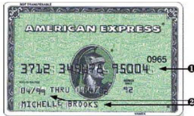
Figure 4-5. Example of Fraudulent Embossing

Characteristics of fraudulent Embossing include: